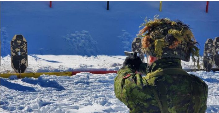
Photo: West Novas on a winter pistol range, Feb' 22.

It has been almost exactly a year since I assumed Command of the Regiment and it has gone by in a flash. Right now, our soldiers are for the most part employed on Full-Time Summer Employment (FTSE) primarily in Gagetown and Aldershot. They