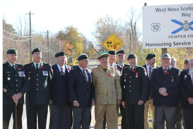
Photo: Highway Naming Nov '22

I would like to close by reinforcing our part - indeed even obligation - to the Regimental Family. It will thrive with our care, or whither on the vine with our neglect.