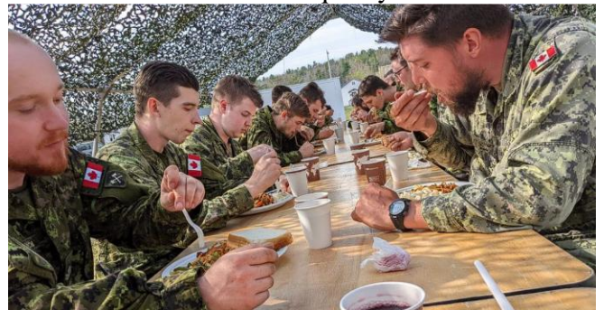
Photo: West Nova soldiers, Italy Day, May 2022

In late May, the Regimental Sergeant Major and I had the pleasure of inspecting our (yet unconsecrated) Colors. The last set prepared over a year ago was found to be lacking and was rejected due to numerous errors and quality shortfalls.